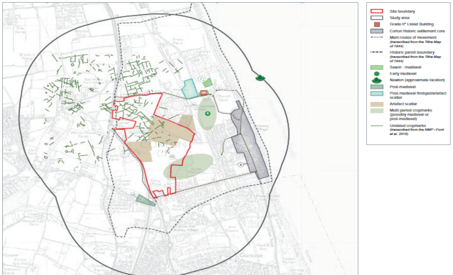
Plan showing potential archaeological finds